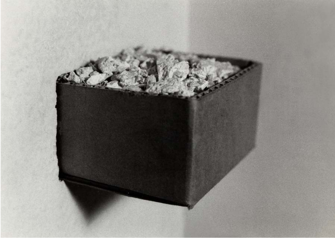
William Anastasi Displaced Site, 1966 Cardboard, plaster, wall incision; cardboard: 2 ¼ x 4 ¼ x 6 inches