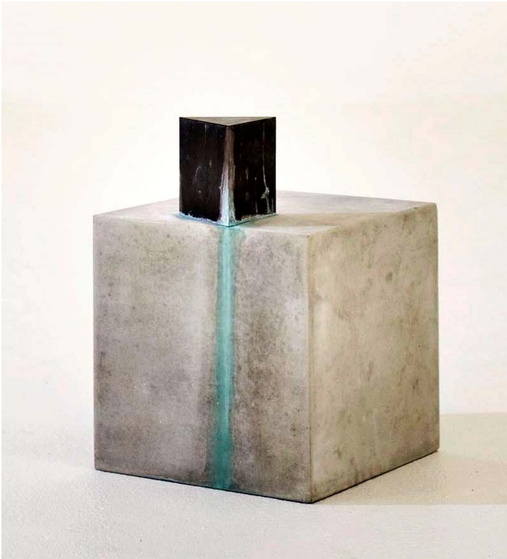
Dove Bradshaw Notation VII, 2007 Limestone, copper, ammonium chloride copper sulfate 16 x 12 x 12 inches; collection of Michael Straus, Birmingham, AL