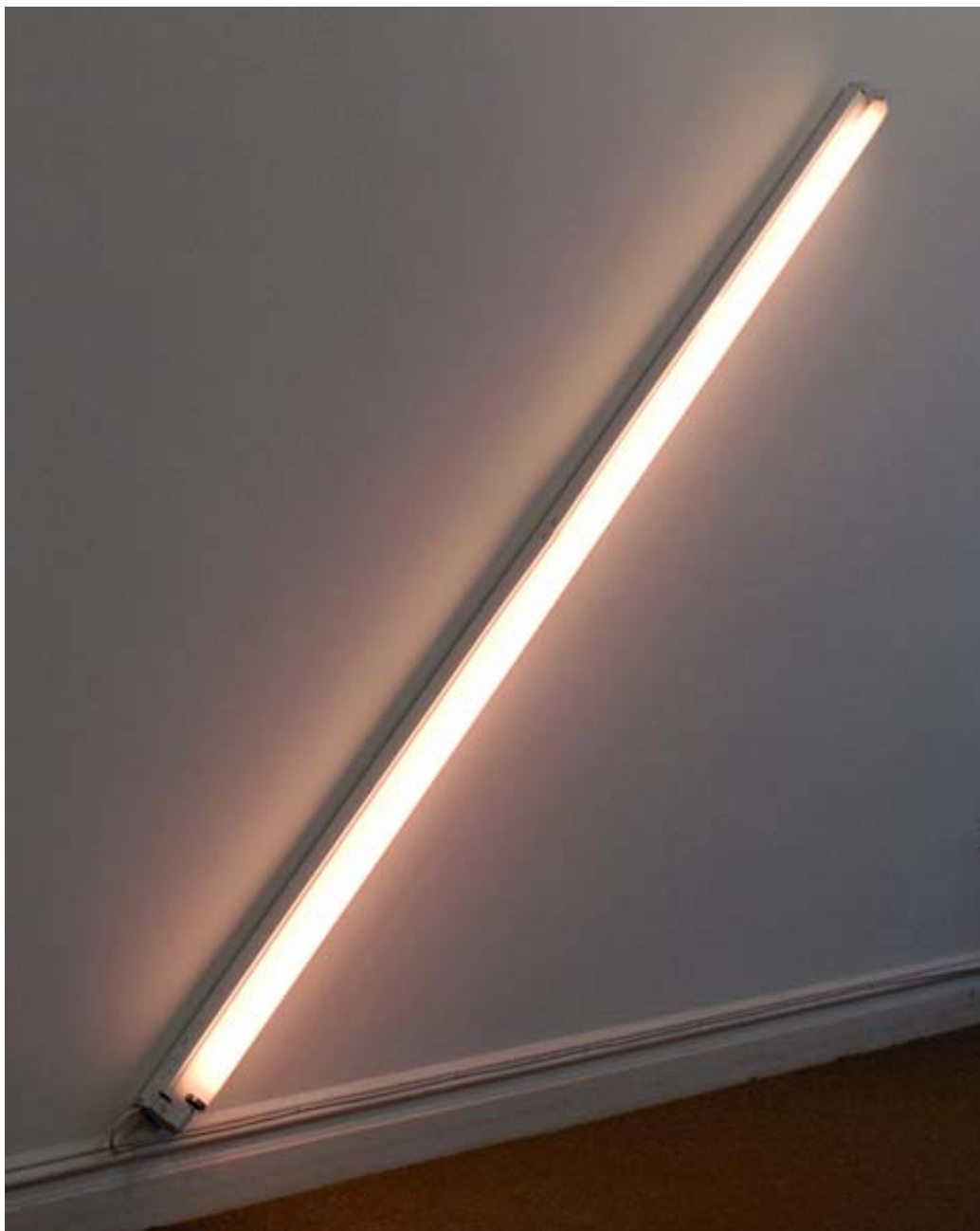
Dan Flavin The diagonal of May 25, 1963, 1963 Pink florescent tube, 96 inches