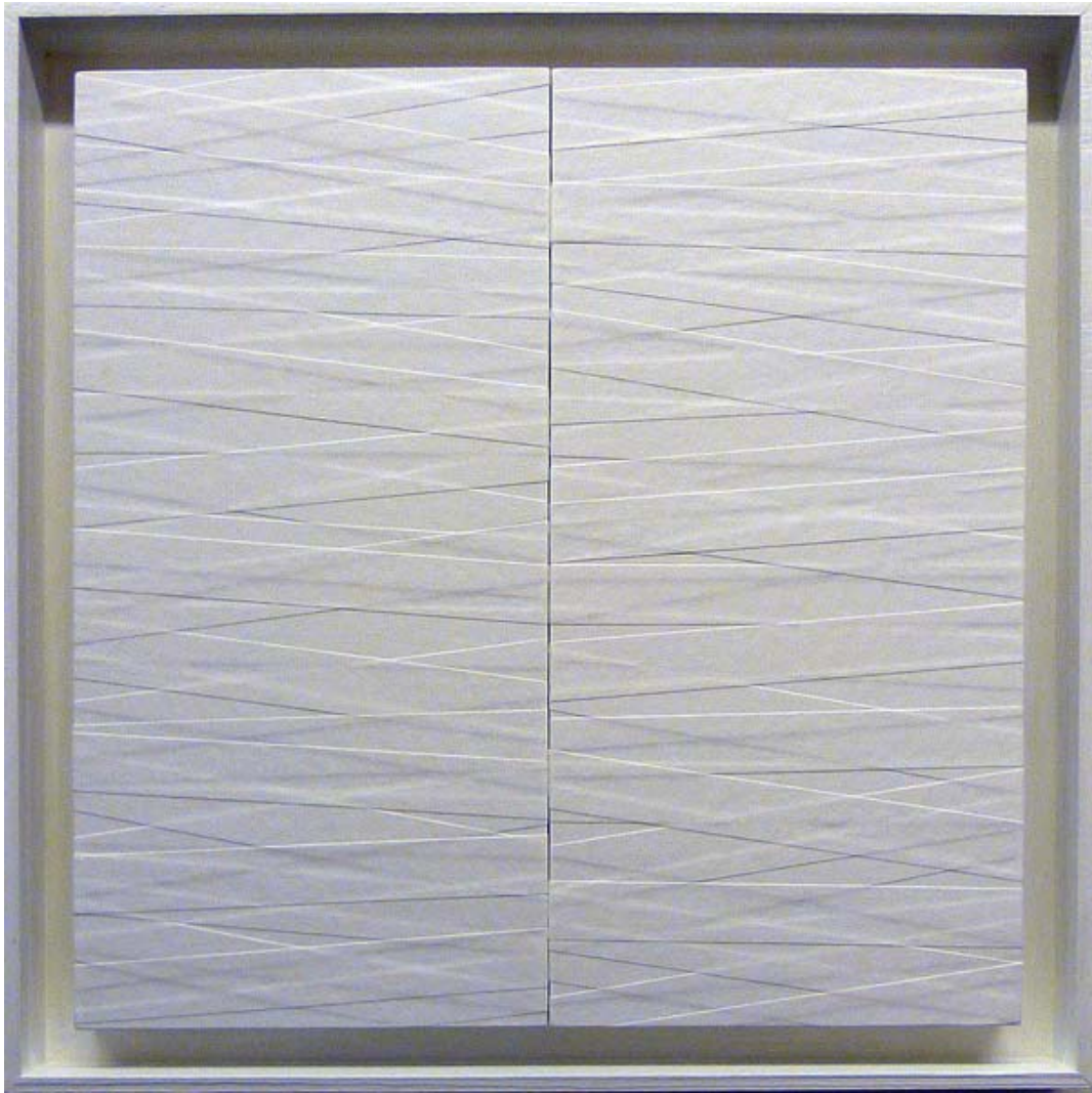
Tadaaki Kuwayama Untitled, TK547-62B, 1962 Japanese paper on board with acrylic paint, 27 x 27 inches