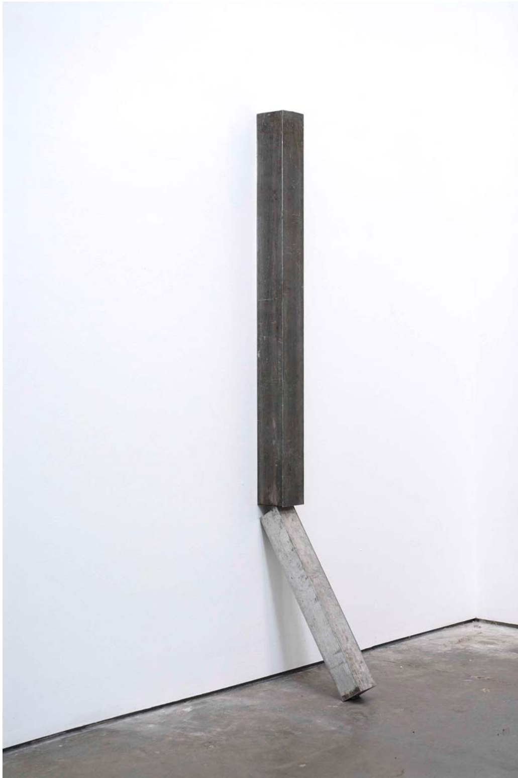
William Anastasi whowasit, what was it, propped, 1966/2004 Aluminum, 57 x 2 ½ x 12 inches